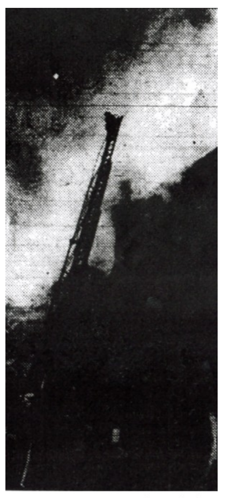
Firemen pour water through the stage roof.

Flames reached scenery on the stage and leapt to the roof, setting it ablaze,